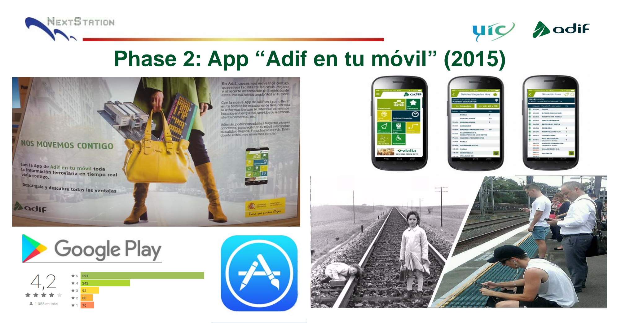
ELCANO, centralized passenger information system of Adif